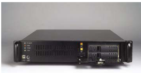
The front view of IPC-2320M