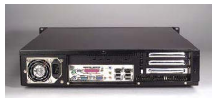
The rear view of IPC-2320M

Each IPC-2320M is configured to meet the customers specifications and given a unique part number. Typical configurations are shown below: