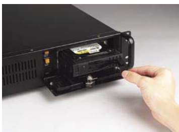
Dual easy-to-maintain SATA HDD trays