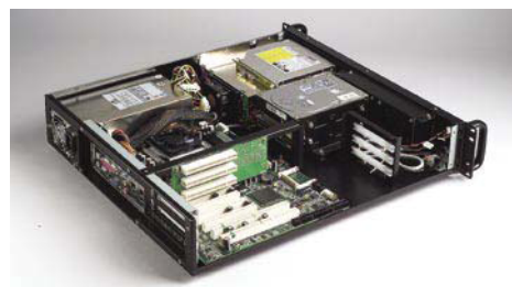
The inside view of IPC-2320M